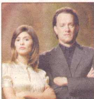
CRACKING THE CODE: The Da Vinci Code the film