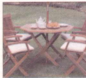
HAVE A PEW: Win luxury garden furniture